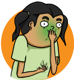
Nausea or vomiting

Call your GP, health clinic or call PCH Pharmacy Department for advice, don't stop the medication.