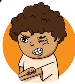
Itchy skin or a rash