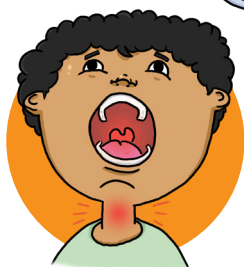
Dry mouth or sore throat