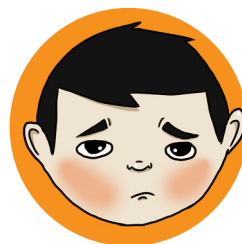
Redness on the face