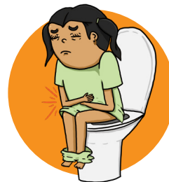
Constipation or stomach upset