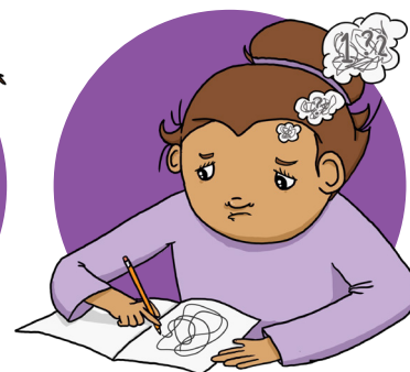
Have problems focusing

If bub's not their normal self or you are worried, see your GP, health clinic or emergency department.