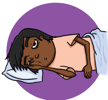
Be upset or tired