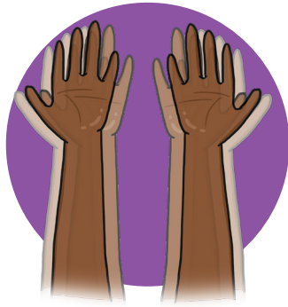
Has blurred vision, seeing double or has other eye problems