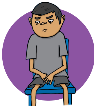
Not their normal self