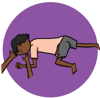
If unconscious, call ambulance