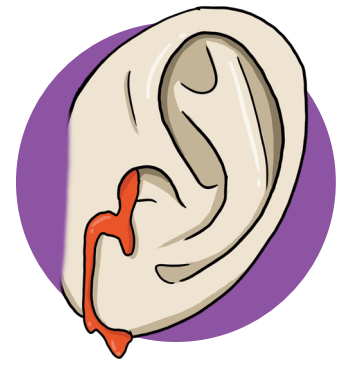
Bleeding from ears or nose