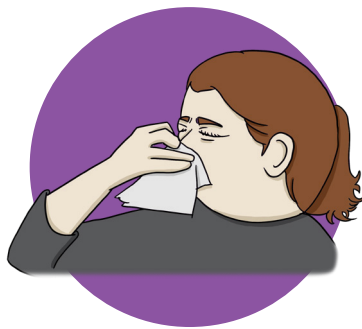
Has watery ooze from their ears or nose