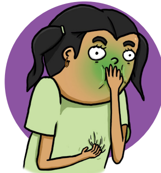
Vomiting a lot