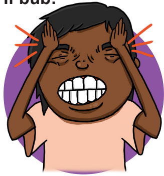
Has a headache or a stiff neck