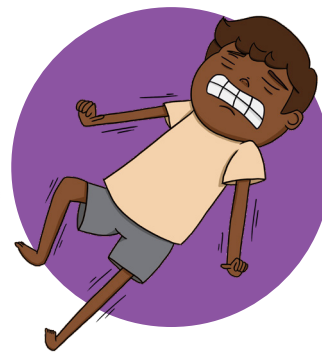
Had a fit or tremors