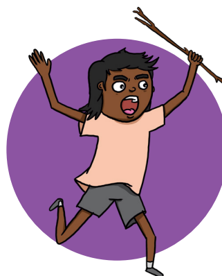
Have mood swings