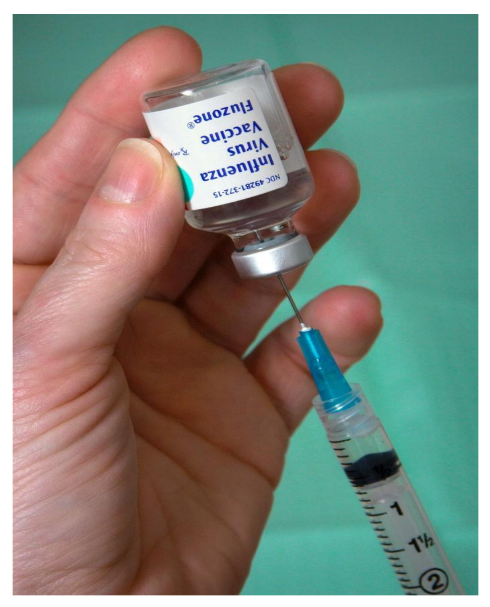
<u>This Photo</u> by Unknown Author is licensed under <u>CC BY-SA-NC</u>